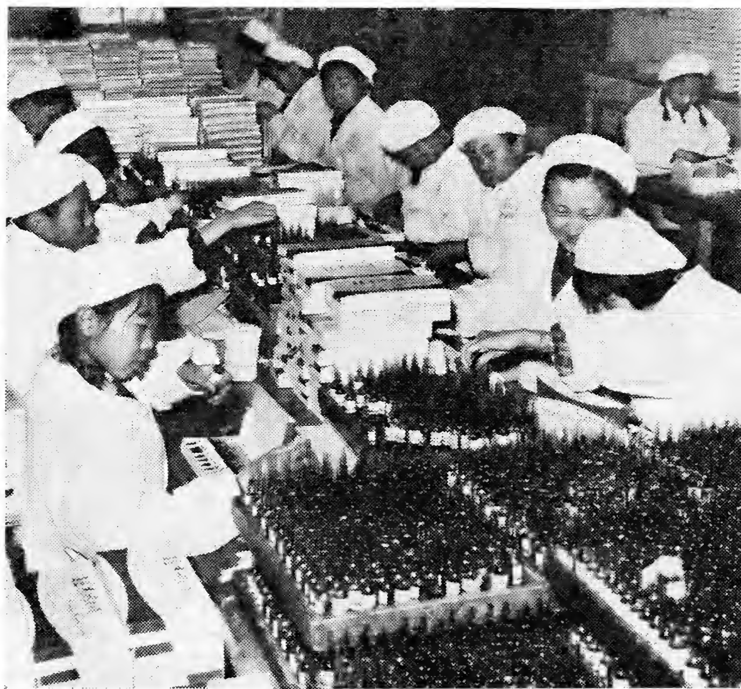
Pupils often work in the pharmaceutical plant.